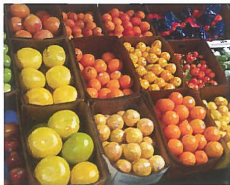
Citrus display at Growers Produce Inc.

choices to have groceries and food delivered — that, and the popularity of staying home to watch Netflix.