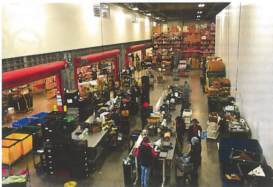
GoodEggs, an online grocery sales and delivery service is based at The SF Market.