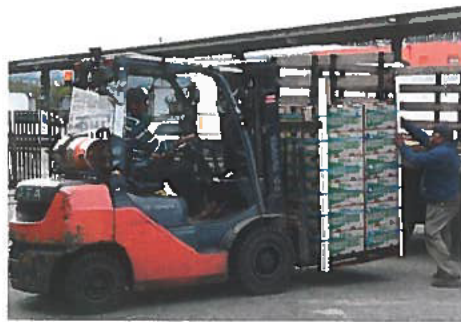
California Brussels sprouts being loaded at Golden Gate Market

"There are more organic products on the market these days, but it isn't necessarily because more people want to eat organic," says Hill of Shasta Produce. "More farms are growing organic because they understand the return per acre is usually higher on anything organic. This extra organic product is forced into the market via open-priced loads when they get stuck. Stores will buy more organic